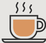
Coffee & Tea