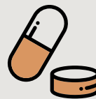
Capsules & Powders